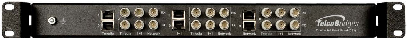
Tmedia TMG7800-DS3 1+1, Patch Panel (front view)