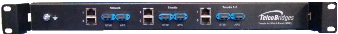
Tmedia TMG7800-STM1 1+1, Patch Panel (front view)