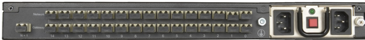
Tmedia TMG7800-STM1-N+1 unit, rear view