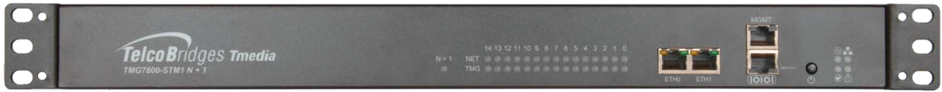
Tmedia TMG7800-STM1-N+1 unit, front view