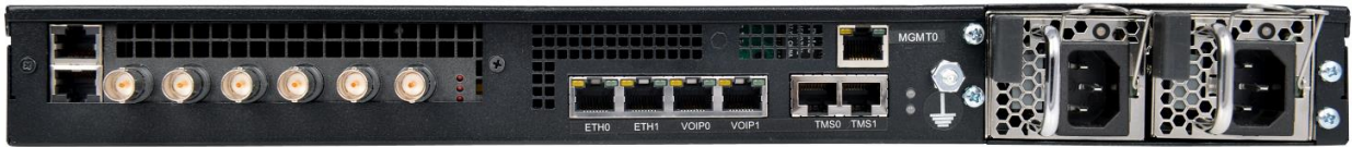
Tmedia TMG3200-DS3 AC (rear view)