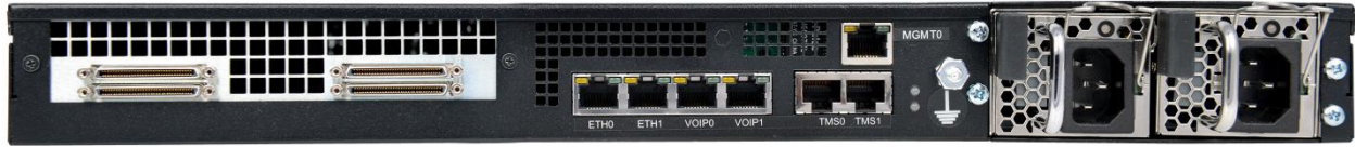
Tmedia TMG3200-TE AC (rear view)