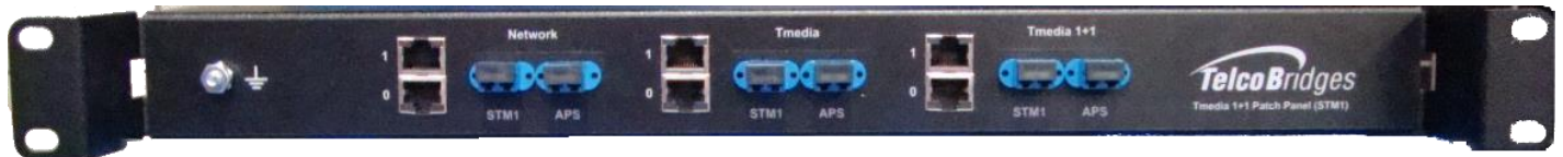
Tmedia TMG3200-STM1 1+1, Patch Panel (front view)

© 2019 TelcoBridges Inc. All rights reserved. The TelcoBridges logo is a registered trademark of TelcoBridges Inc. This document and any products or functionality it describes are subject to change without notice. Please contact TelcoBridges for additional information and updates.