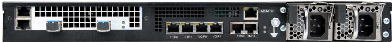
Tmedia TMG3200-STM1 AC (rear view)