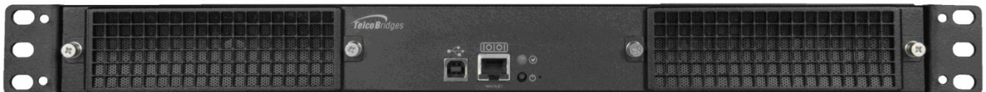
Tmedia TMG3200 (front view)