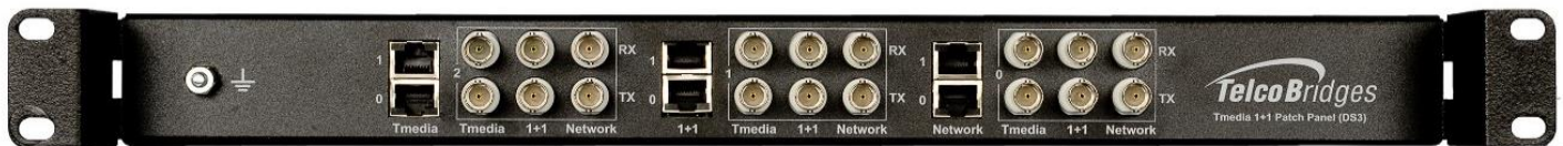
Tmedia TMG3200-DS3 1+1, Patch Panel (front view)