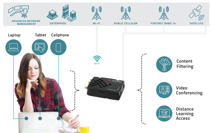
CONNECTED DISTANCE LEARNING