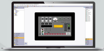
Computer Running Crimson® & connected via RLDialUp, RLConnect24