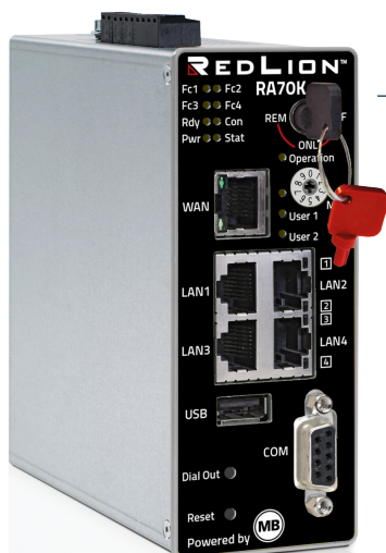
RA70K Keyed Remote Access Router

Ensure your devices are always up to date with the latest firmware and patches.