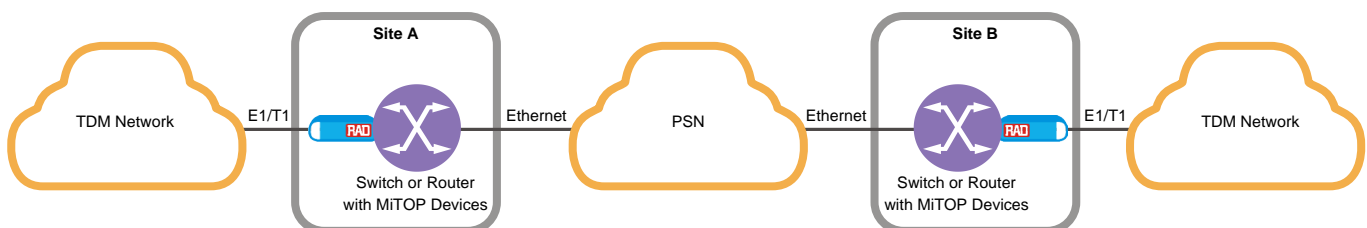
Figure 3. Delivering E1/T1 Services over PSN