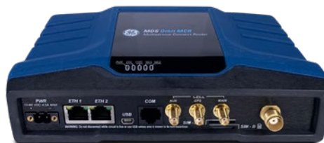
MDS Orbit MCR with Cellular and 900 MHz