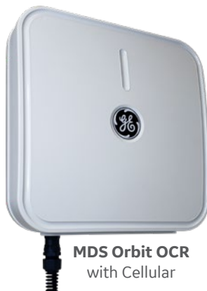
MDS Orbit OCR with Cellular

The MDS Orbit platform supports standards-based SNMP and Netconf network and device management protocols for easy integration into MDS PulseNet as well as 3rd party network management software. It supports Command-Line Interface (CLI), an intuitive web-based Graphical User Interface (GUI) as well as wizards to simplify and speed the configuration of complex tasks. Orbit's user experience is identical regardless of radio technology or form factor.