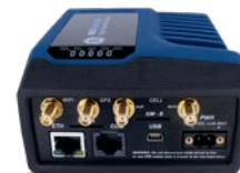
MDS Orbit ECR with Cellular and WiFi