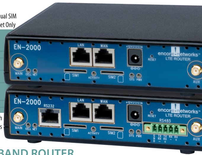
EN-2000™ Dual SIM with Ethernet and Serial Ports