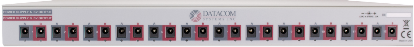
Rack mountable power with hot swappable power supplies and a modular management interface card