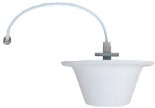
Indoor Omni Antenna