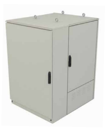
ADTRAN MC500ES Cabinets