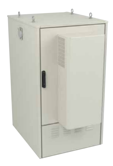
ADTRAN MC500 Cabinets