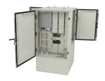
ADTRAN Crossover Enclosure