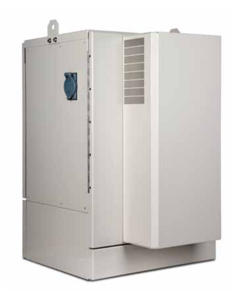
ADTRAN SmaRT Cabinets