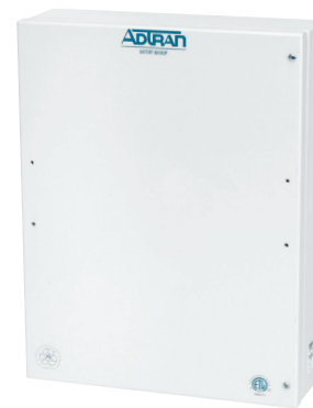
Total Access Wallmount 1175044L2