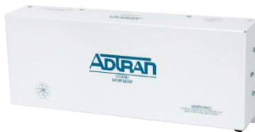
Total Access Rackmount or Wallmount 1175044L1