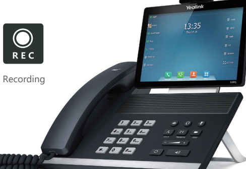
Cloud Platform Compatibility Multi-touch Screen