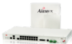
Airmux-400 Point-to-Point Broadband Wireless Access