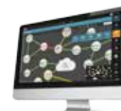
RADview Management and Domain Orchestration