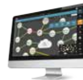
RADview Management and Domain Orchestration