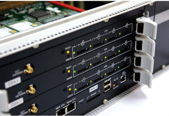
HG-3000/3U PRI-GSM Gateway

Connect your PBX to your GSM mobile network and cut your telephone bills