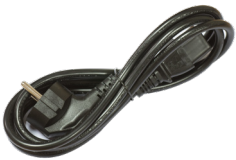
2 IEC cords