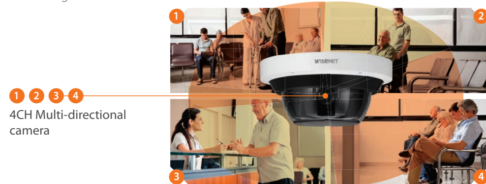
1 2 3 4 4CH Multi-directional camera

Hanwha Techwin two- and four-sensor multi-directional IP camera solutions include motorized Pan-Tilt-Rotate-Zoom (PTRZ) capabilities and 2MP and 5MP selectable fixed lens models that eliminate the need for multi-camera installations. Each multi-sensor IP camera is installed with a single cable and works with most VMS using just a single device recording license.